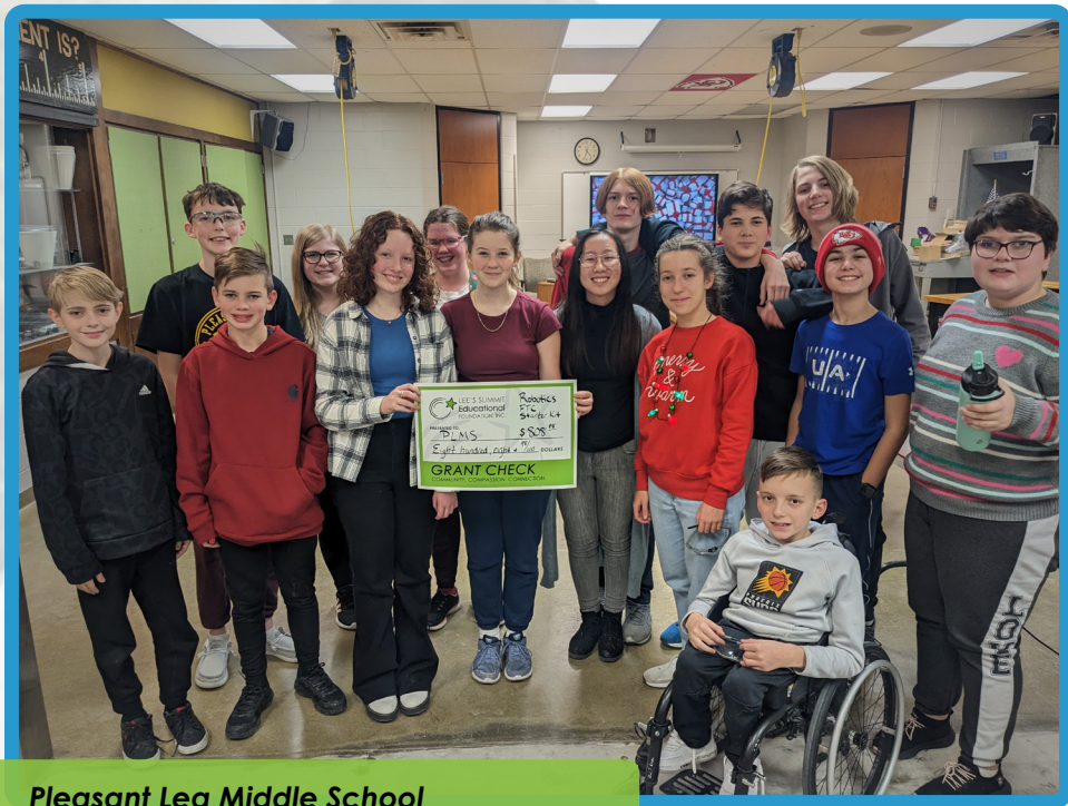
Pleasant Lea Middle School Robotics Team is presented with their $800 grant check for an FTC Starter Kit.